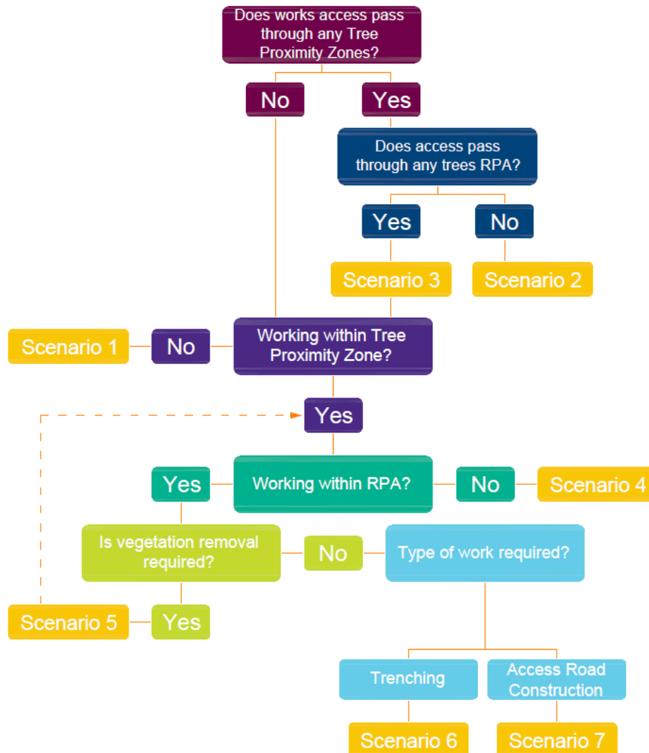
Figure 1.2: Tree protection scenario flow chart.